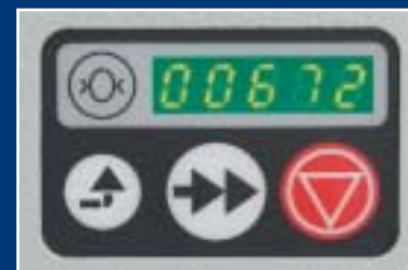
Re-settable electronic counter.