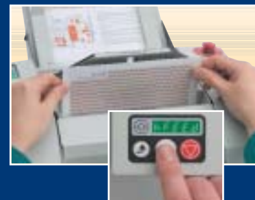
Single form hand-feed station.