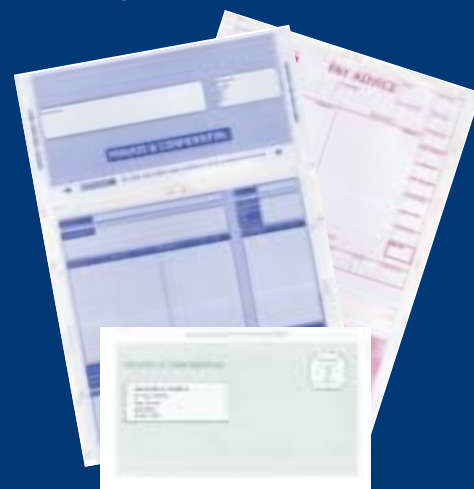
Pressure seal forms catering for a wide range of mail applications.

The AS300 and AS500 are only part of PFE's comprehensive range of pressure sealers - Please contact us for more information.